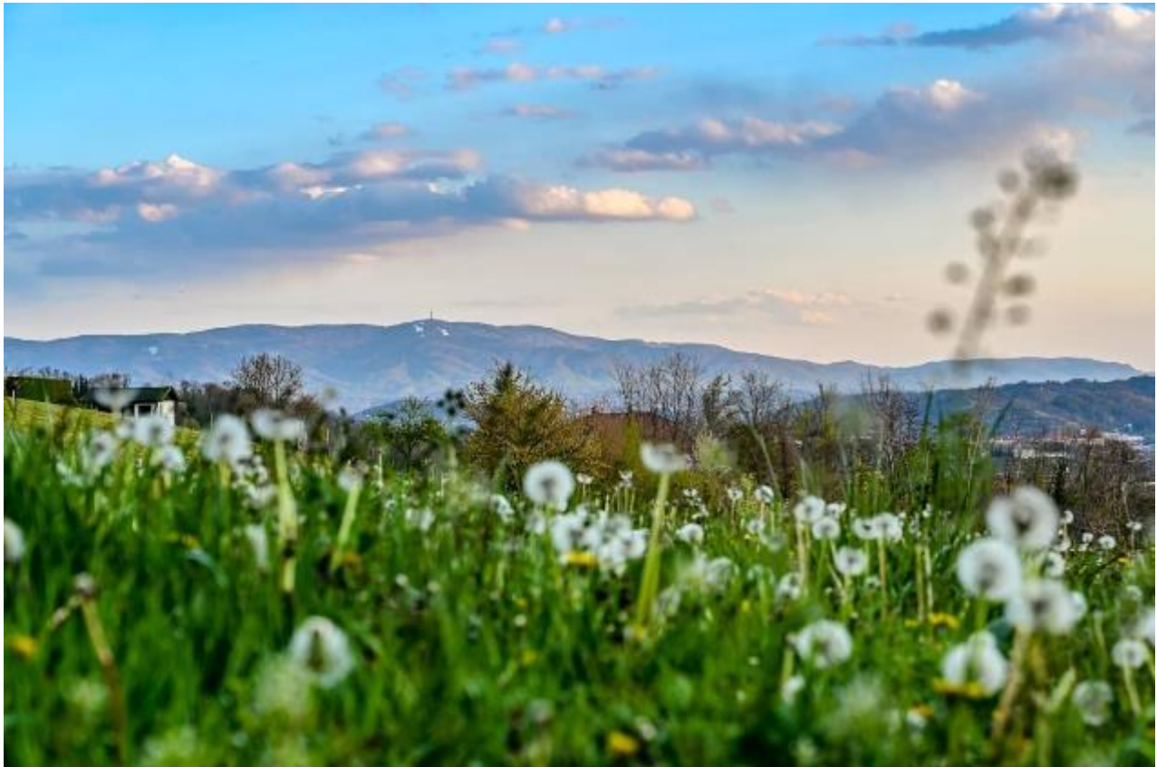
Green waves of the hills – Hrvatsko zagorje, continental part of Croatia

Krapina-Zagorje County, Croatia 9 th – 11 th November 2022